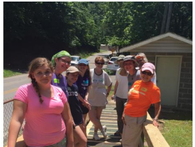
Youth Group on Summer Mission Trip in Appalachia

for those that needed to have a way to get in and out of their homes, but also building relationships with those who we helped. We were also able to build relationships with each other and another group from St. Louis that served with us. At the end of our day we would spend a few moments in prayer and reflection on how God had worked through us that day.