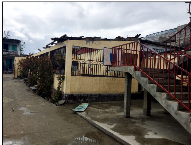
Left: Cathedrale St. Louis Building where meals are provided for the homeless.