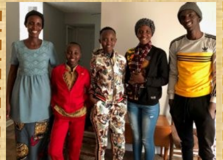
Bottom, Christmas party and tree decorating.