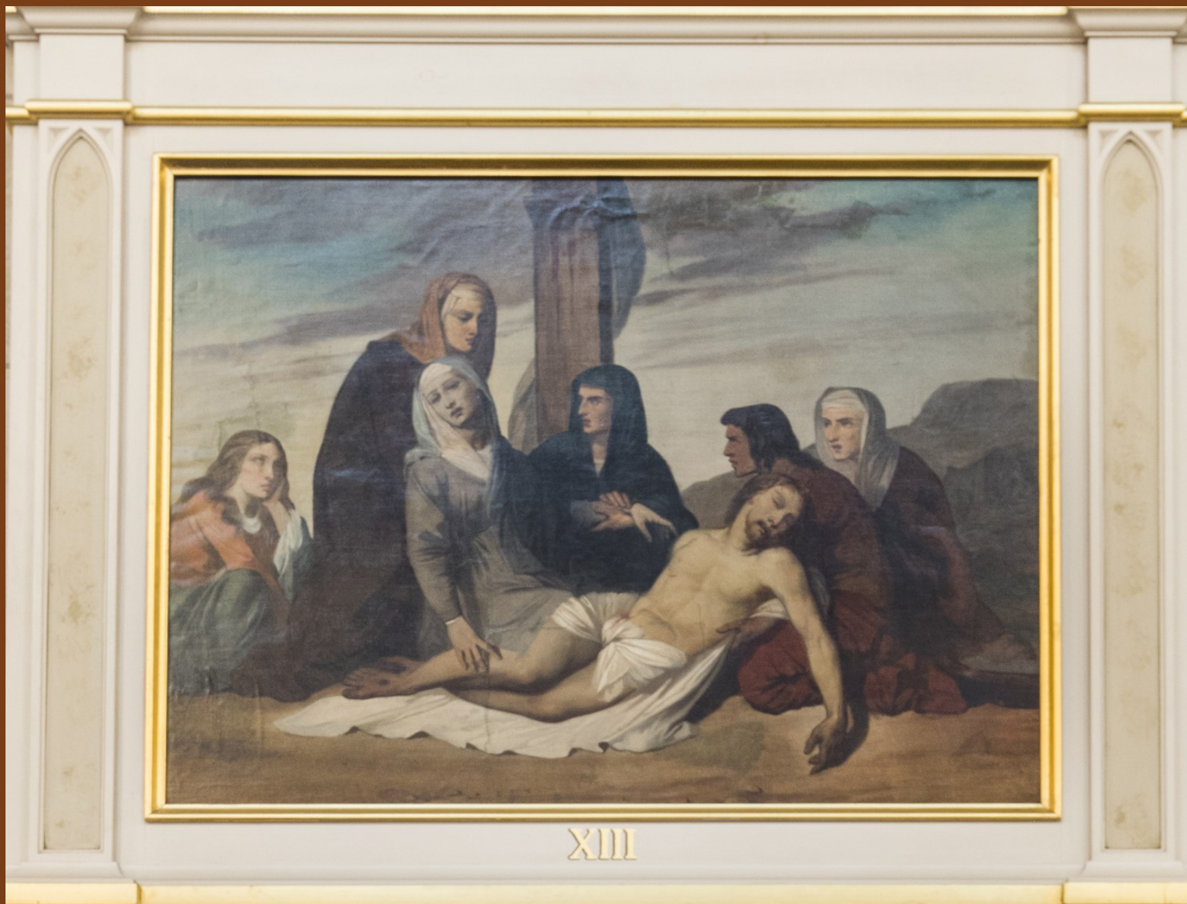
The Thirteenth Station—Jesus is Taken Down from the Cross